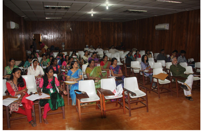
Audience of the International Seminar