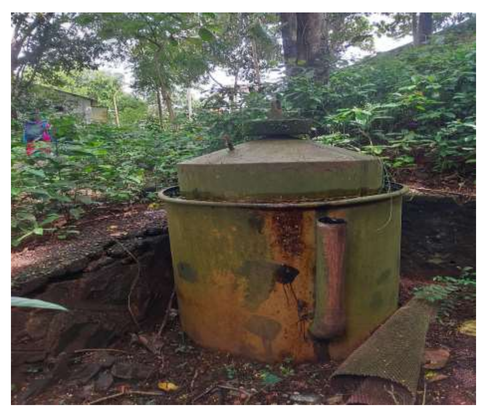
figure 2 FRP BIO GAS PLANT

Sree Sankara College installed 1M<sup>3</sup> FRP bio gas plant in its CANTEEN for catering food wastes generated from college hostel and canteen. At presently this FRP water sealed plant is not functioning which needs to be repaired.