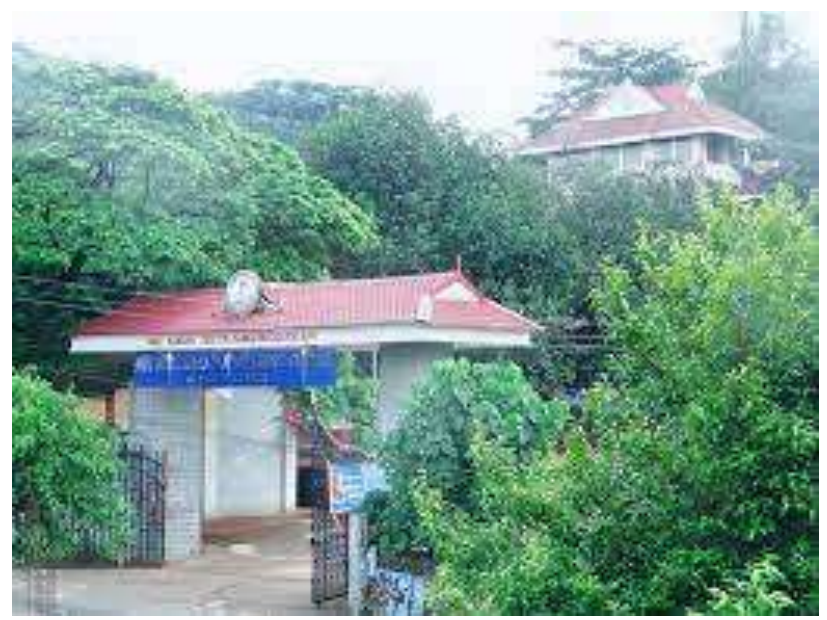
Figure 1 COLLEGE CAMPUS