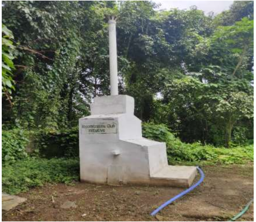
Figure 3 OPEN TYPE INCINERATOR

for plants. The ash generated from plastic will be treated separately. The ash generated from canteen where wood is used as a fuel is used as manure for plants. The college campus is promoting biodegradable packaging and reducing the consumption of plastic to a large extent.