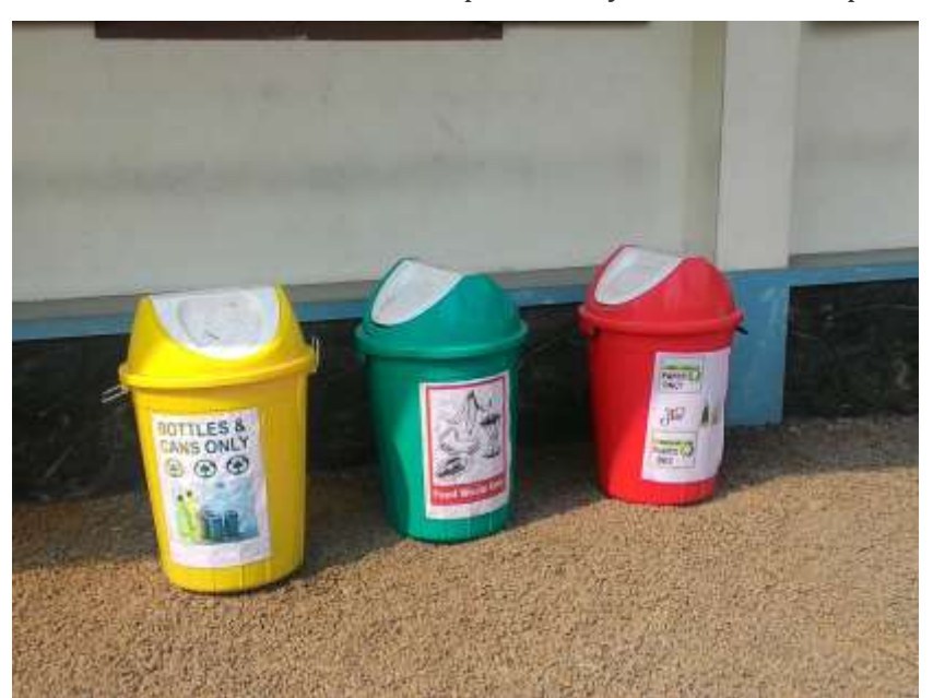
Figure 4 COLLECTION BINS