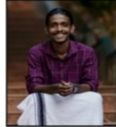
Christo Shajan DC 3 Physics Cover page and Design

As part of International Women's Day celebration, Various competitions were held for girl students.